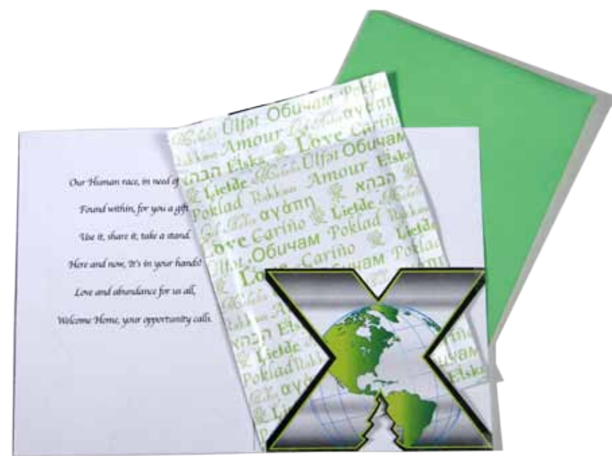
You will receive your Power Strips in an air-tight mylar bag conveniently tucked into a greeting card.

Power Strips are completely safe for adults and children alike. They are to be worn daily between bathing. They are for everyone, to be worn everyday as a health habit. Excellent when placed on the lower back, or where they are needed most. The only caution is in cases of extreme dermatitis.